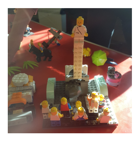
Exploring the events of Holy Week and Easter at Messy Church