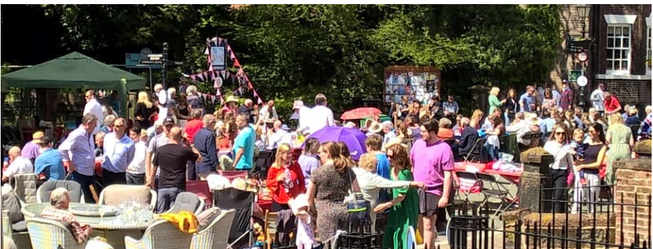
The Coronation street party on Tarporley High Street by St Helen's Church

May 2023 Along with hundreds of other communities in the UK and around the World Tarporley Parish joined in with the celebrations, special services and party spirit as King Charles III was crowned our monarch at the beginning of May 2023.