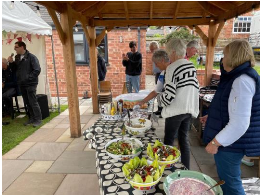
The BBQ at The Drays.