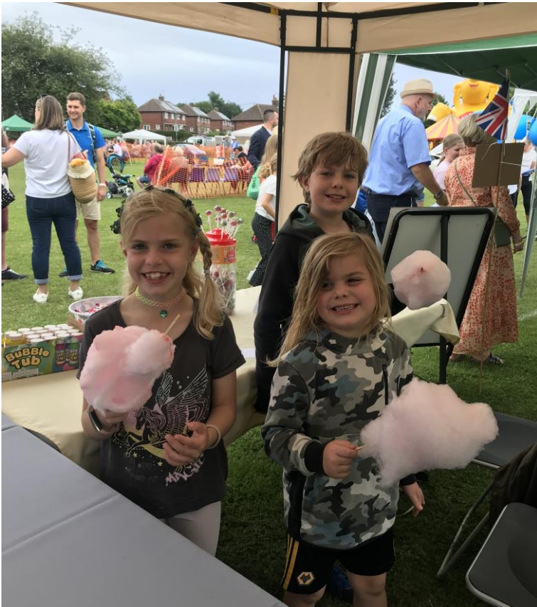
Having fun at Tarporley Carnival.

The bells of St Helen's rang out to announce widely that the procession on its way; but the ringing may well have been drowned out locally by the joyful music of the marching bands and the cheering and chatter of the crowd.