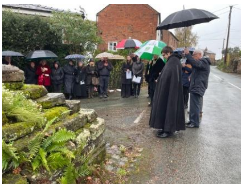
Remembrance Sunday at Eaton