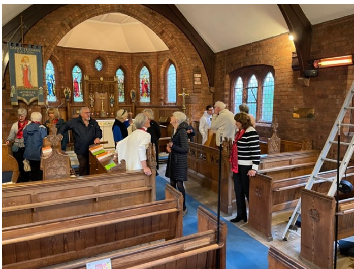
Infrared heater trials at St Thomas' Eaton

There's plenty we can do to make our own positive impact on biodiversity!