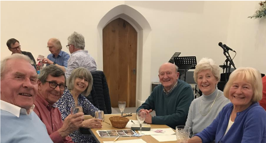
One of the teams at the Christian Aid Quiz