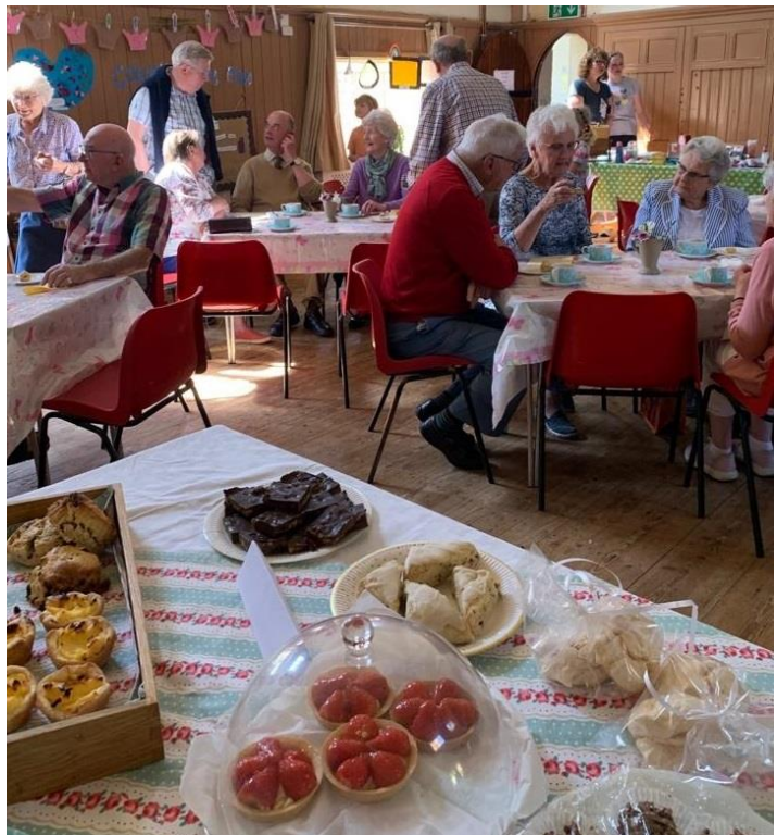
Delicious cakes and good company

Thank you to all those who joined in with the fun. We ate delicious cakes and enjoyed good company. A total of £654 was raised for St Helen's Church funds.