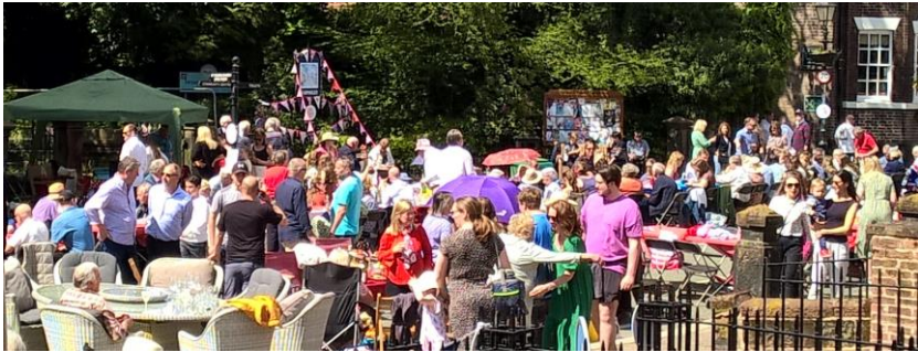
Above:-The street party on Tarporley High Street by St Helen's Church

Some photos below try to capture some of the scenes.