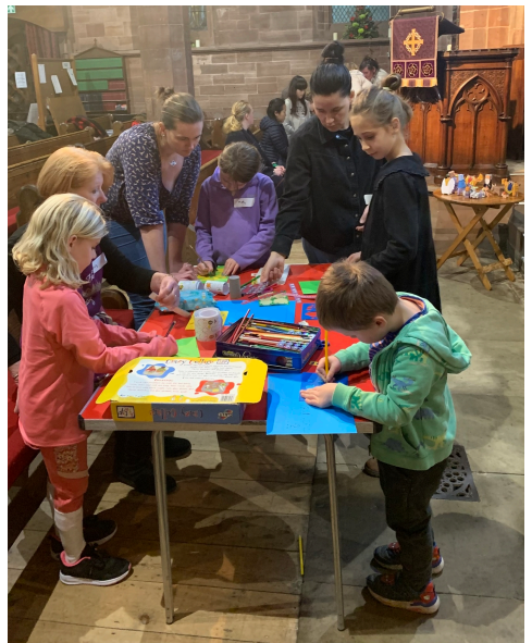
Clockwise from top:- "Warm space at St Helen's", Messy Church and Carols at Eaton.