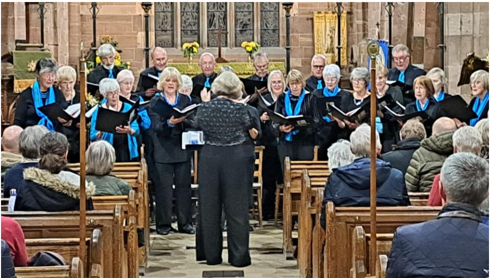
The marvellous Kelsborrow Choir

Thank you to Kelsborrow for entertaining us, especially as this was only their second in-person performance since the pandemic. They will certainly be welcome back in the parish again!