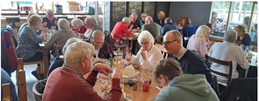
Tarporley Parish Harvest Supper