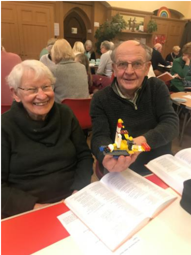
....And others at play!