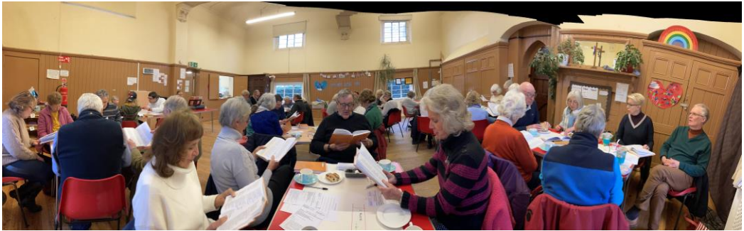
Café Church in the Done Room: people at work:-